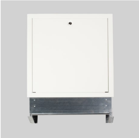
Manifold cabinet, flush-mounting, white (RAL 9010)