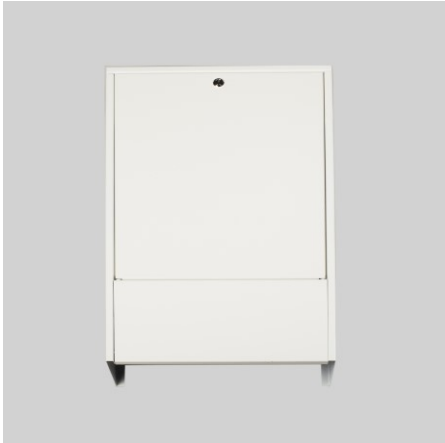
Manifold cabinet, surface-mounting, white (RAL 9010)